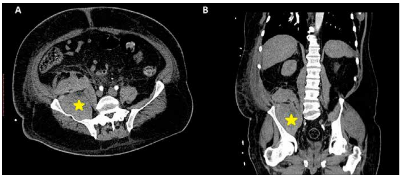
Figure 2. A CT scan of the abdomen and pelvis (transverse section [A], coronal section [B]); showing retroperitoneal haematoma, marked with a yellow star

There is no general consensus as to the best management plan for patients with WS. In this particular case, conservative management was successful. Most haemodynamically stable patients can be managed with fluid resuscitation, correction of coagulopathy, and blood transfusion. Endovascular treatment involving selective intra-arterial embolization or the deployment of stent-grafts over the ruptured vessel is attaining an increasingly important role. Open repair should be reserved for cases when there is failure of conservative or endovascular measures to control the bleeding or endovascular facilities are unavailable [7,21]. Open repair of retroperitoneal bleeding vessels should be reserved for cases when there is failure of conservative or endovascular measures to control the bleeding. Open repair is also required if endovascular facilities or expertise is unavailable and in cases where the patient is unstable. Despite available treatment options, the mortality of patients with retroperitoneal haematoma remains high.